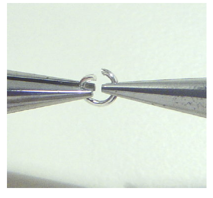
Step 4) With your dominant arm still tight and your other hand steady, pull the Snapeez<sup>®</sup> back towards your body and pass the opening of the Snapeez<sup>®</sup> a little

Step 3) Keep a good grip on the Snapeez<sup>®</sup>. Hold your hands parallel. Don't move them up and down. While holding your non-dominant hand steady, open the Snapeez<sup>®</sup> by pushing the natural opening side of the ring away from your body with your dominant hand.