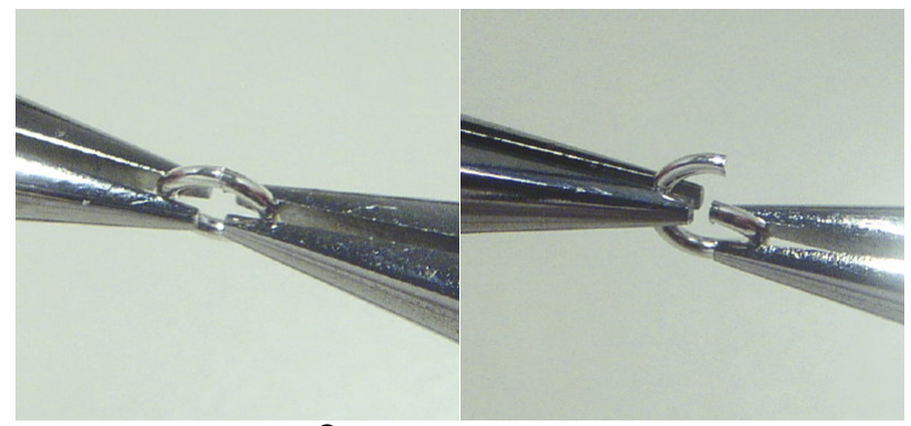
Step 5) Then push the Snapeez<sup>®</sup> back toward the opening and BRUSH the sides of the opening together with your dominant hand and you should hear a SNAP ! Remember... BRUSH...SNAP ...

bit. The sides of the opening of the Snapeez<sup>®</sup> should BRUSH against each other.