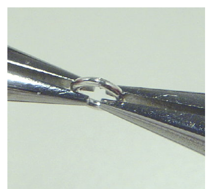
Step 6) Look directly at the spot where you did the BRUSH and SNAP. Now WIGGLE the Snapeez<sup>®</sup>™ back and forth at this spot a little bit to get a nice alignment to your closure. Remember...BRUSH...SNAP...and WIGGLE!